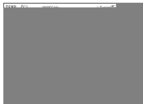
Wave Soldering (Flow Soldering)